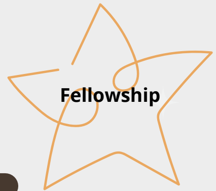
International Women's Day Walk/Run/Ride